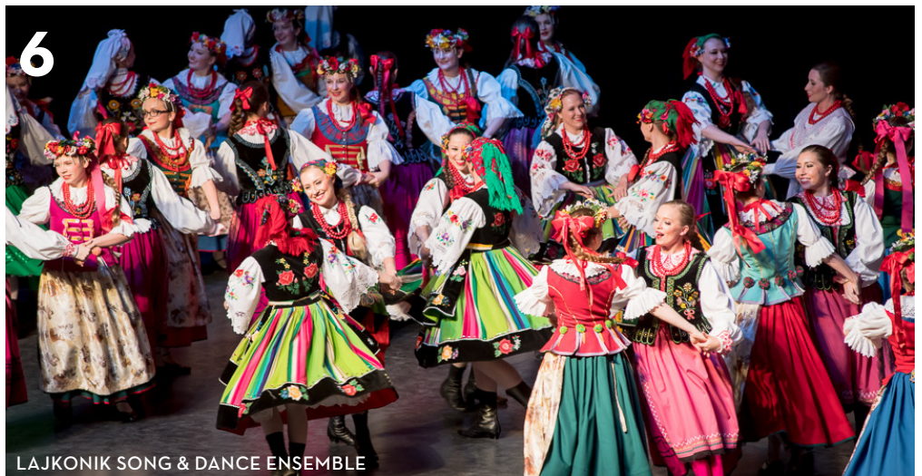
LAJKONIK SONG & DANCE ENSEMBLE

The library's new Multicultural Collection includes books, music, and movies, as well as cultural objects like this 6-foot-tall statue inspired by the sarcophagus of Egyptian Pharaoh Tutankhamen. See pages 4–6 for more.