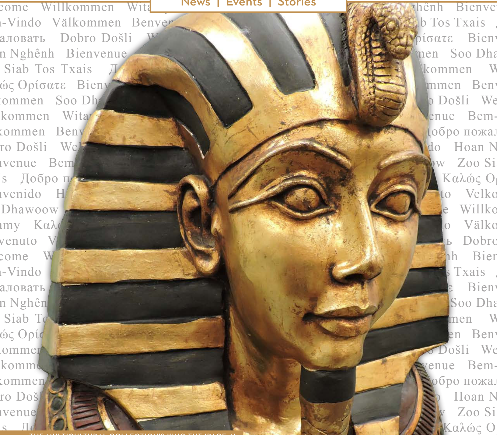
THE MULTICULTURAL COLLECTION'S KING TUT (PAGE 4)

PAGE 6 Multicultural Collection: First-Look Friday